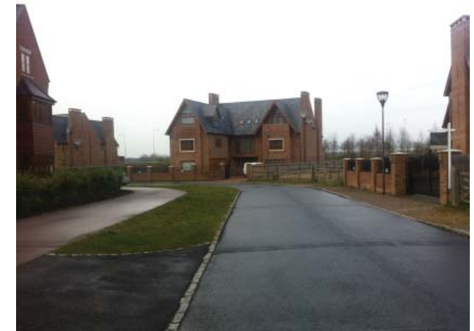
The existing view of Queensbury Lane.