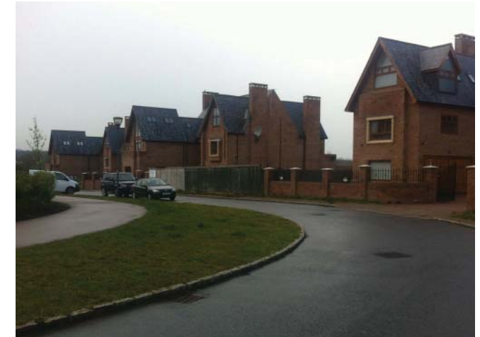
A cycle path (Redway) runs along the opposite site of Queensbury Lane.