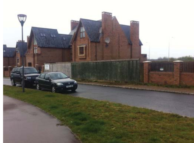
Plot 4 is on a straight section along Queensbury Lane