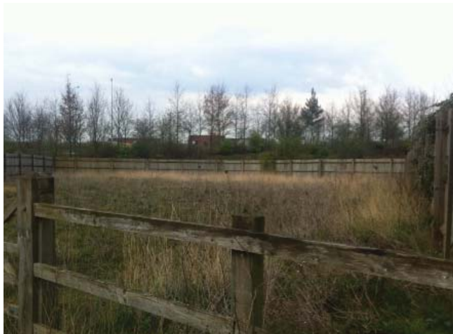
Plot 6 is the largest plot as it's located on a corner.