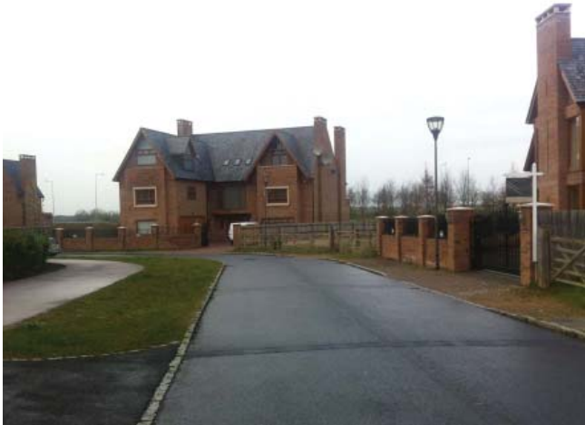
The existing self build plots have been bought by a local developer who has built large brick houses.